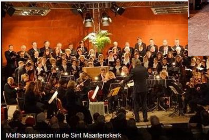
Matthäuspassion in de Sint Maartenskerk